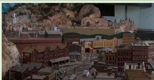
Colorado Model Railroad Layout

The address for TWMRC is 6808 Forest Hill Drive, Forest Hill, Texas 76140.